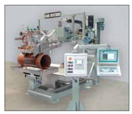
Online Testing System for ERW-Pipes. The probe holders can be moved between the testing position and the calibration position. In the calibration position, a short pipe segment is used for the sensitivity setting of all probes.