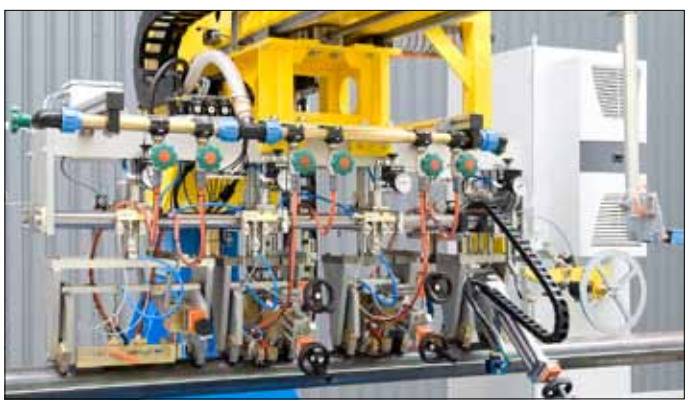
Probe holders for online testing machine (transverse and longitudinal defects)

After pipe cutting, a final weld inspection is carried out (offline weld testing). A testing portal with moveable carriage is commonly used. The testing portal shows the advantage that the weld is inspected without pipe movement, thus avoiding vibrations which could degrade the test results. The pipe ends can be tested in the same testing system or in a separate setup.