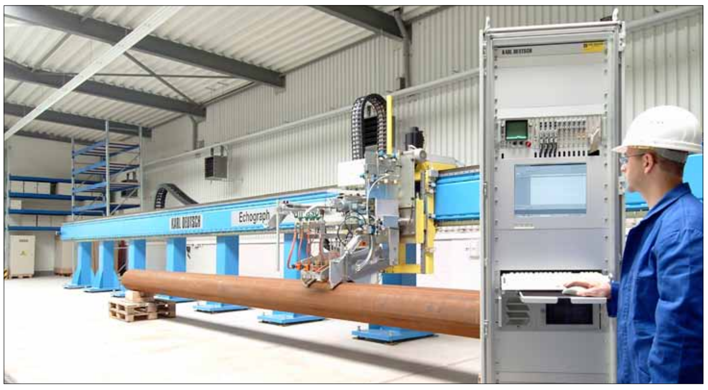
Testing portal (offline testing machine) during assembly at KARL DEUTSCH workshop