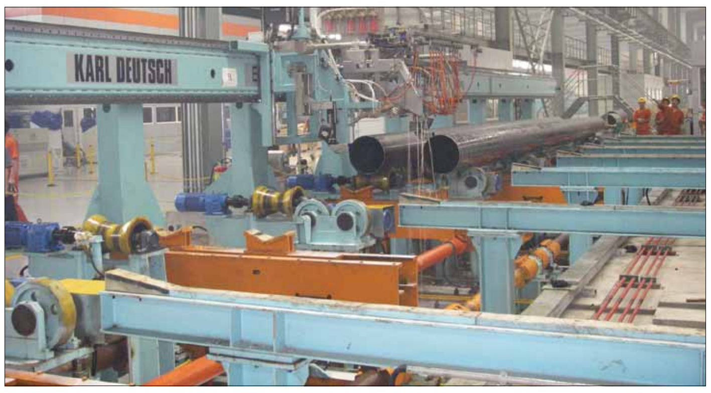
Testing Portal (Offline Testing Machine): Onsite operation with transverse conveyor for pipe feeding and linear discharging of the pipes. This machine was also equipped with two additional probe holders for the pipe end inspection.