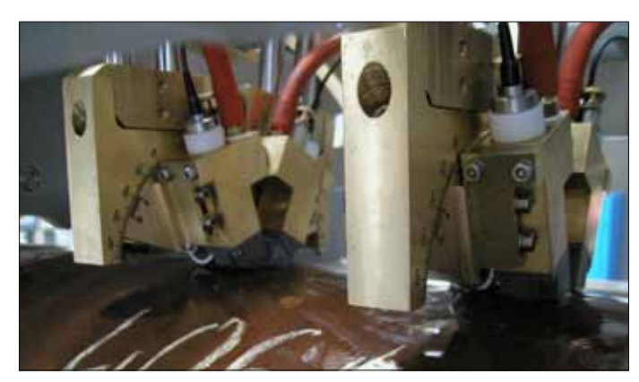
Probe holders with angular incidence for the detection of longitudinal defects. Stable ultrasonic coupling is achieved by water jet coupling (also called squirter technique). The incidence angle can be adjusted without steps for a perfect setting with respect to pipe diameter and wall thickness and without changing the probe.