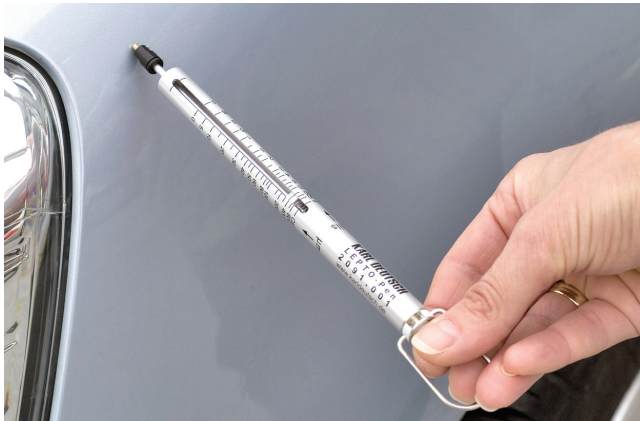
Thickness measurement on automobile paint coating (application example)